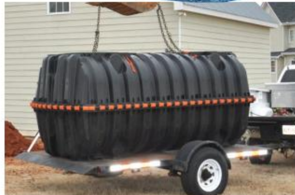
Lightweight • Durable

The strength and versatility of Infiltrator's Septic Tanks enable a wide-range of installation possibilities including shallow installations and multiple and serial tank configurations.